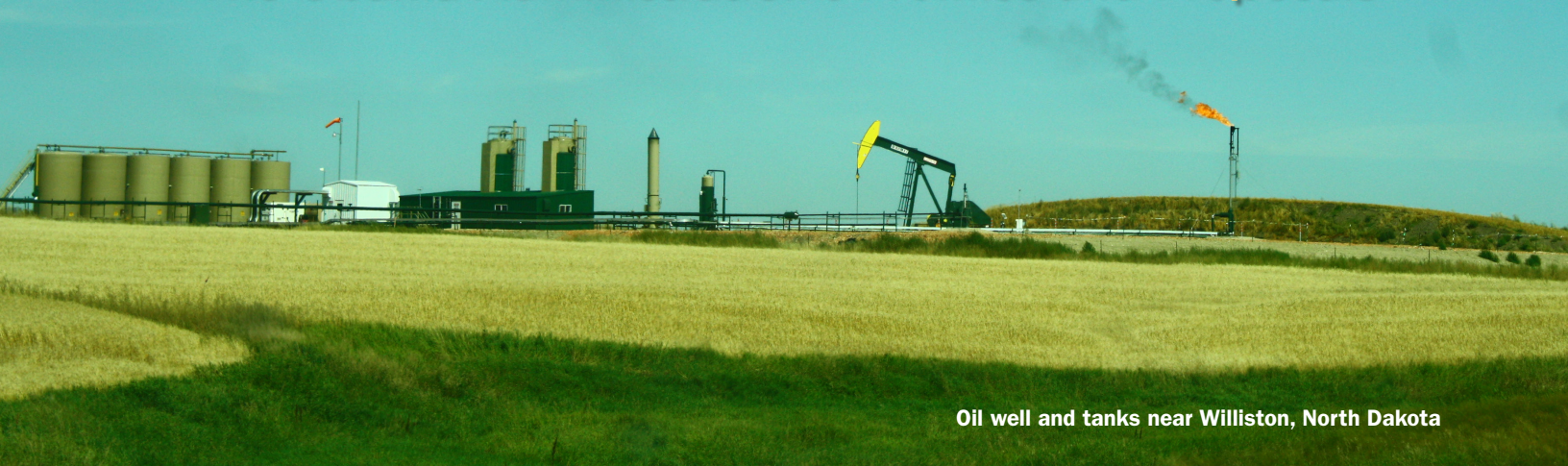
Oil well and tanks near Williston, North Dakota