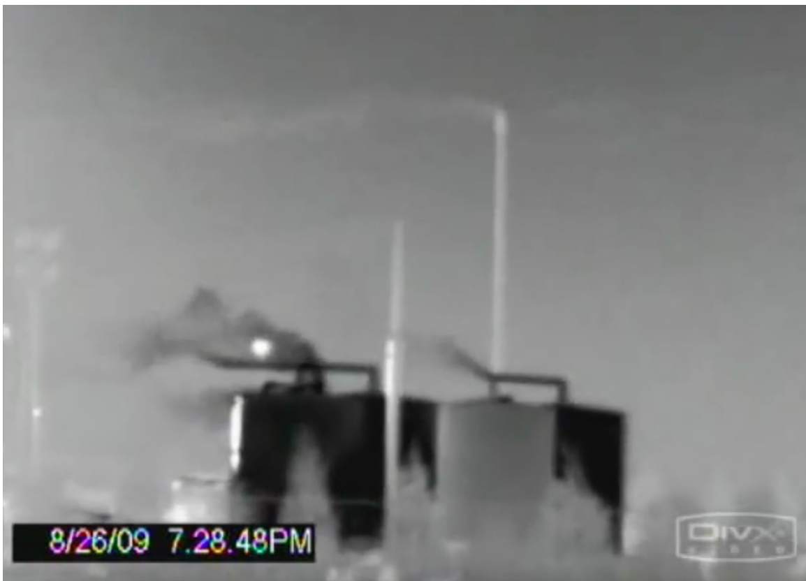
Compressor station near Blue Mound, Texas as seen through a regular camera and a specialized infrared camera used to detect gas leaks.