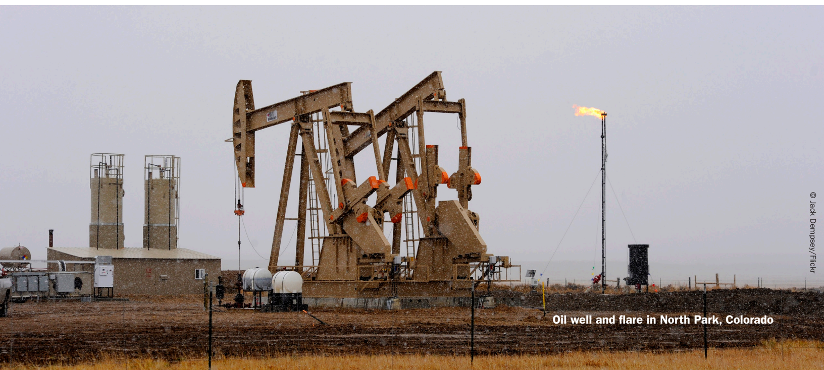
Oil well and flare in North Park, Colorado

In addition to the proposed methane New Source Performance Standards (NSPS), the Administration's proposed rules also include Control Technique Guidelines (CTGs), and the recently unveiled methane rule from the Bureau of Land Management (BLM). 10 The proposed NSPS, by its nature, would only achieve reductions at new and modified facilities—and, as noted above, the vast majority of projected emissions come from existing sources. The CTGs would apply to VOC emissions from